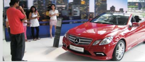
And is gaining the attention it deserves.