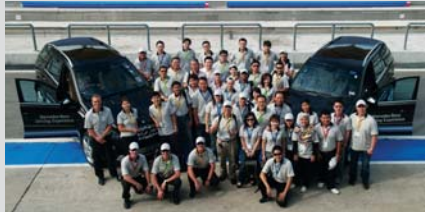
July Mercedes-Benz Driving Experience

Owning a Mercedes-Benz is an indication that you have made it but we at Hap Seng Star would like take it a step further. With our Mercedes-Benz Driving Experience (MBDE) organized by Mercedes-Benz Malaysia in July and November 2010, we had our customers leaving the Sepang International Circuit with a resounding 'Wow' at the end of the day. Taking Mercedes-Benz cars to their limit, customers were exposed to key aspects of safety driving with the thrill of dynamic driving. Reservation is on a first come first serve basis* so please register for a special driving experience when you make your next purchase!