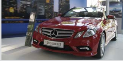
A beauty has just arrived to our Autohaus.

The newly launched E-Class Cabriolet with its AIRCAP technology captured the attention of every visitor coming into our KL Autohaus, all longing to feel the air flowing through their hair!