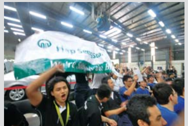
The supportive Hap Seng Star cheer leading team.