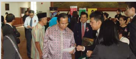
Prospects' enquiries being addressed by our sales team.

On the 2 October 2010, Hap Seng Star Kota Kinabalu Sales Team proudly showcased the Hap Seng Star brand at the CIMB's Preferred Banking Seminar. The event was catered for CIMB's 90 elite customers.