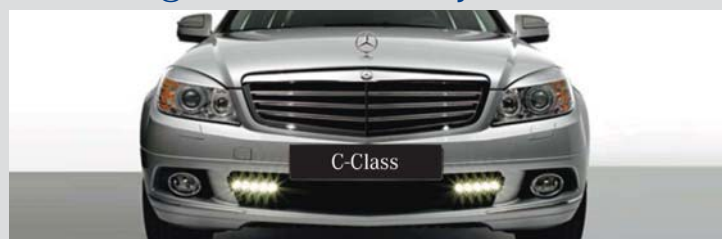
Daytime driving lights for the C-Class (W204)