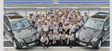
November Mercedes-Benz Driving Experience