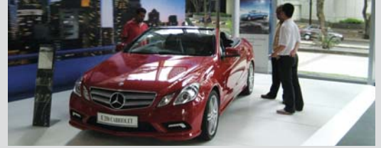
Time and again, our KL Autohaus gives every Mercedes-Benz fan an unforgettable experience.