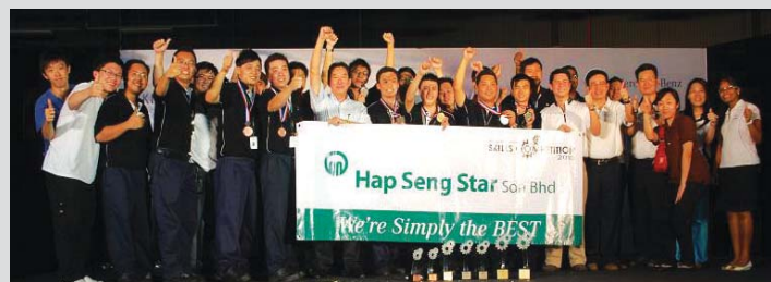
Hap Seng Star After-Sales group photo at the end of the fruitful and exciting competition.