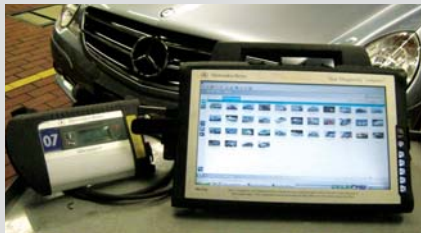
The new generation wireless Mercedes-Benz Star Diagnosis used by Hap Seng Star Service Centre.