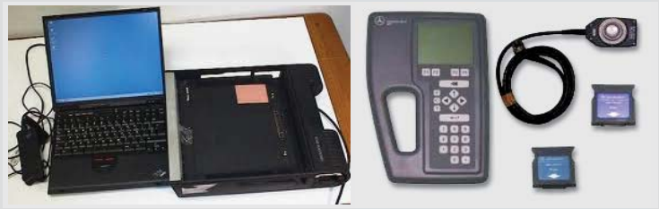
Obsolete Star Diagnosis and Hand Held Tester used by private workshops (or unauthorised dealers).