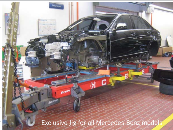
Exclusive Jig for all Mercedes-Benz models

➔ With a vehicle as exclusive and precious as your Mercedes-Benz, why take a chance on anything less?